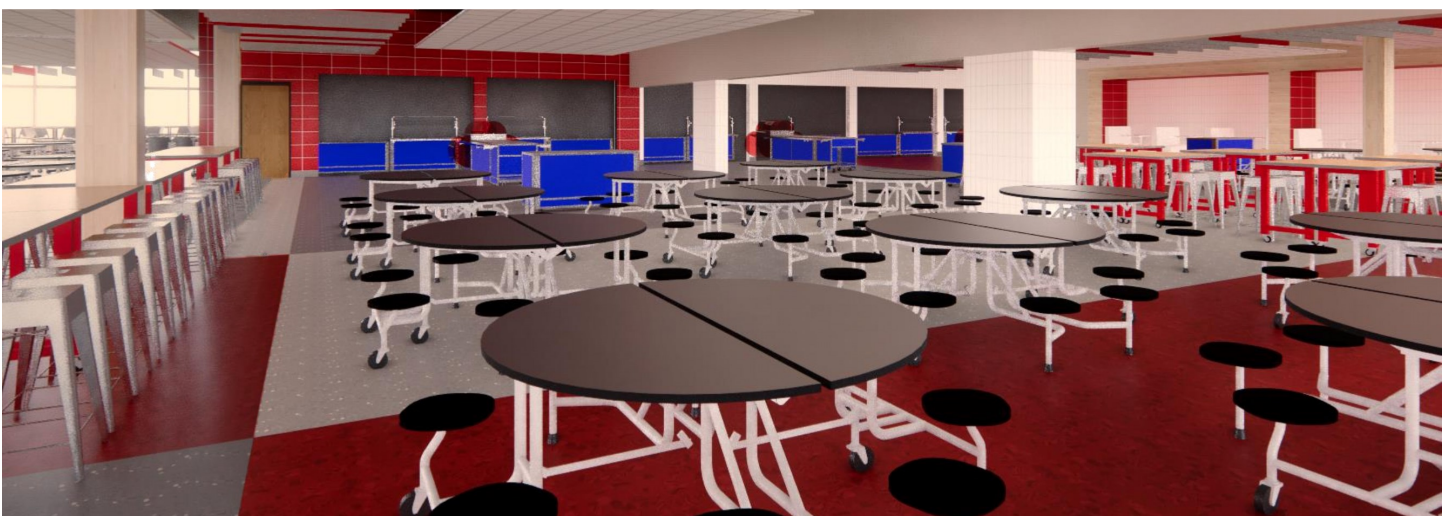
From top: Renderings of reception area, breakout and small-group rooms, and cafeteria